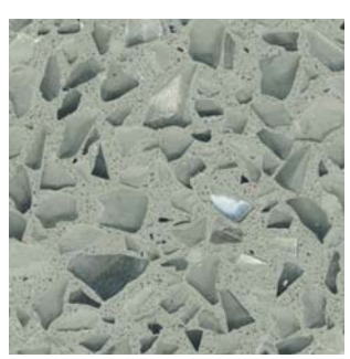
Mondéco Crystal Ice Agate Grey