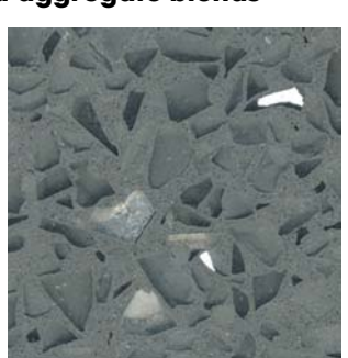
Mondéco Crystal Ice