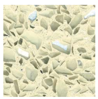
Mondéco Crystal Ice Oyster White